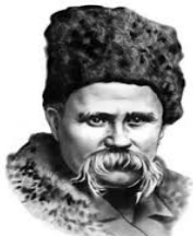
Тарас Шевченко (1814—1861)

Taras Shevchenko – a special celebration to honour our great Ukrainian poet, Taras Shevchenko will take place today, Sunday, March 13 th after the Div. Lit. at 9:00 a.m.